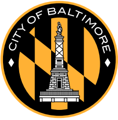
Catherine E. Pugh Mayor