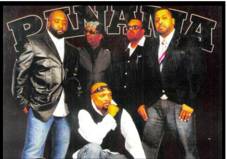
Panama Band Pop, R&B/Soul Afternoon

Bring chairs, a blanket, a picnic basket and the whole family.